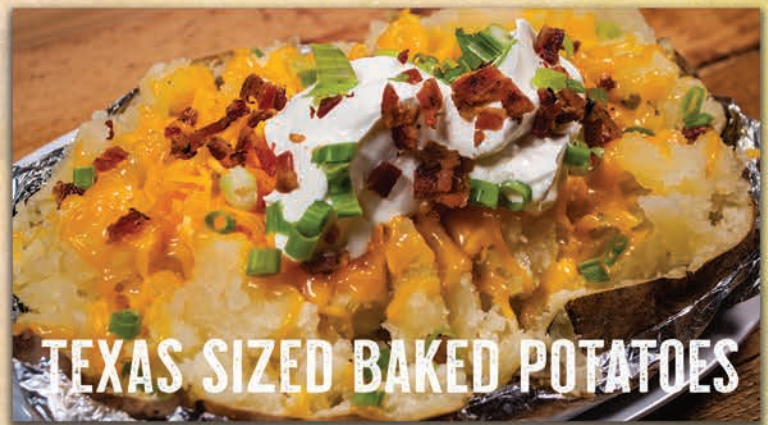
TEXAS SIZED BAKED POTATOES

SERVED WITH FRENCH FRIES OR MASHED POTATOES & SALAD (SUBSTITUTE BAKED POTATO-ADD 5.99)