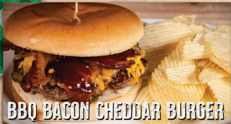
BBQ BACON CHEDDAR BURGER

SUBSTITUTE FRENCH FRIES: 2.99 SUBSTITUTE CHILI CHEESE FRIES: 4.99