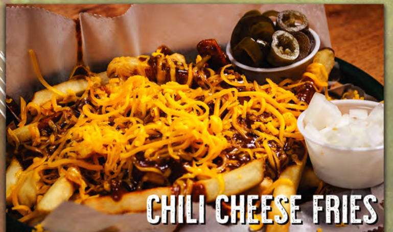
CHILI CHEESE FRIES

Hot Turkey or Hot Roast Beef on Texas Toast with Brown or Cream Gravy, Served with French Fries or Mashed Potatoes and a Salad