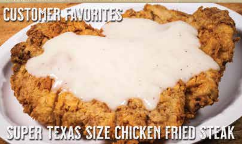
SUPER TEXAS SIZE CHICKEN FRIED STEAK

SOUP AND SALAD COMBO 10.99 A Bowl of Homemade Soup and a Garden Fresh Salad