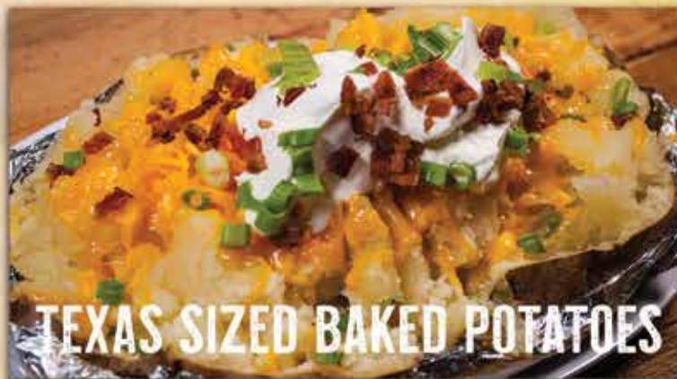
TEXAS SIZED BAKED POTATOES

SERVED WITH FRENCH FRIES OR MASHED POTATOES & SALAD (SUBSTITUTE BAKED POTATO-ADD 5.99)