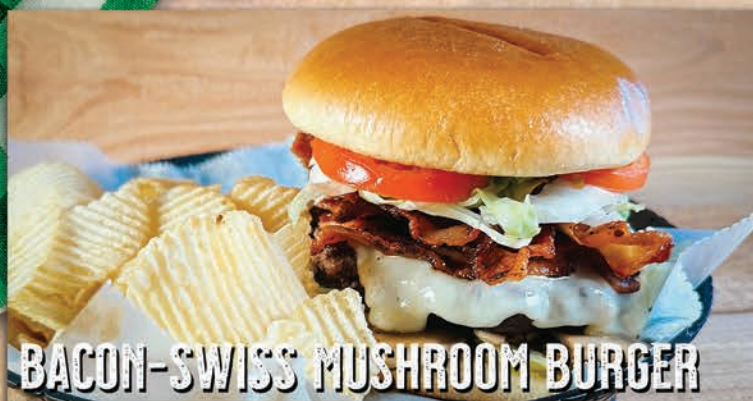
BACON-SWISS MUSHROOM BURGER

SERVED WITH COMPLIMENTARY RUFFLES POTATO CHIPS