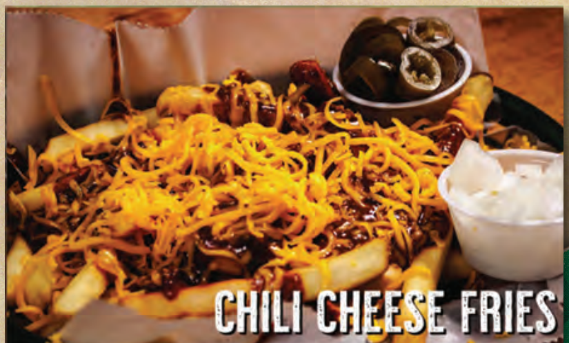
CHILI CHEESE FRIES